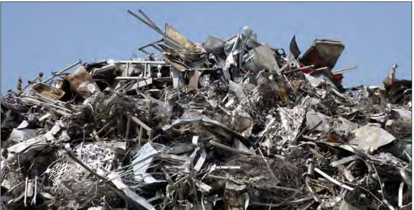
The two classes of costs that should be taken into account are material and conversion costs. Material costs include all the things you buy in order to make your product, such as scrap.

After you have dealt with the materials that your product is actually made