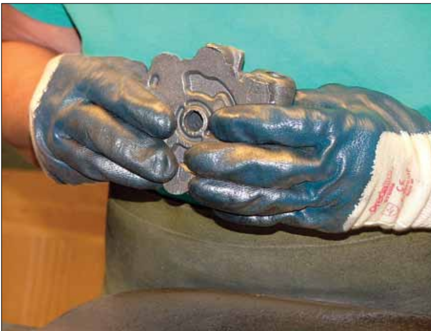
Costing and estimating should be hands-on processes. To obtain valid and reliable data about your metalcasting facility, head to the shop floor.

mal profit (where marginal revenue equals marginal cost) and maintains its long term viability.