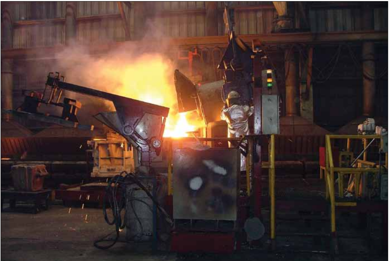
Conversion costs can be either direct, such as melting and pouring, or indirect. When determining your indirect costs, be sure to include all of your overheads, such as material handling and transport costs and administrative and departmental costs.

If you are considering a computerized enterprise resource planning/material requirement planning system for your facility, make sure that the estimating and costing portion of the system is flexible, intuitive, user friendly and specific to the metalcasting industry. Estimating and costing do not happen overnight. It is best to keep it simple and grow into it. Paramount amongst considerations, regardless of the model or the software system, is that the data is valid and reliable. MC